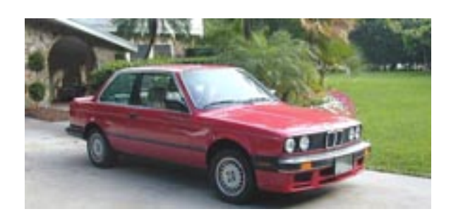
Tom Nangle's BMW

Although automobiles are limited by their Gross Vehicle Weight Rating (GVWR), they can be safely converted. If the GVWR is exceeded, the vehicle is there will be additional brake wear, handling problems, and possibly structural failure. Therefore, automobiles can sustain only lightweight battery packs, typically 12 V batteries, to ensure their safety. Design considerations include: