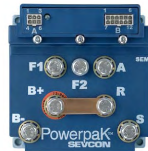
SEM Motor Controller