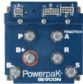
Series Motor Traction Controller

Dedicated flexible solution. The Pump Motor Controller comes standard with two variable and five configurable speed inputs as well as speed compensation for use in power steering applications.