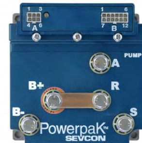
Series Motor Pump Controller