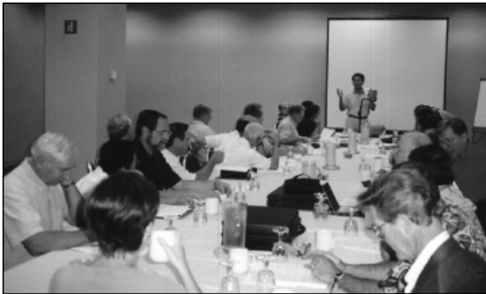
APEC Program Committee works on final program

PS: We are working on having a "special" guest/speaker at the plenary session—stay tuned.