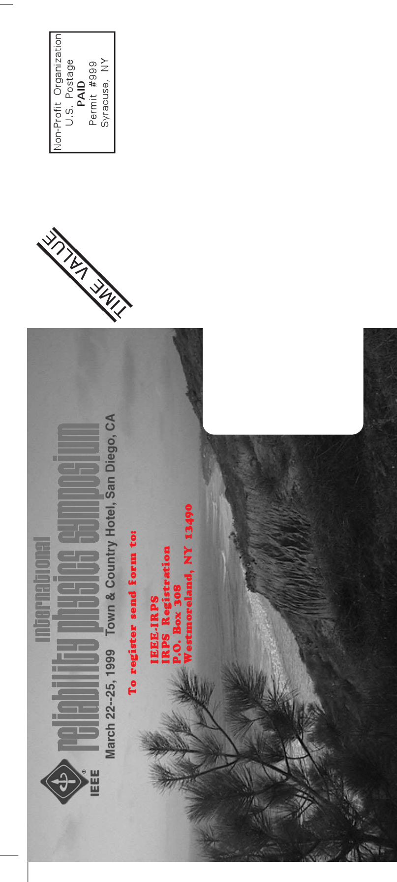
page 39 1/7/99 11:40 p.m. EST