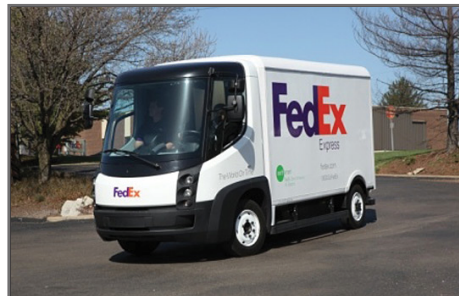
PHEV and EV Commercial Vehicles