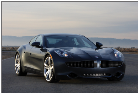
PHEV and EV Passenger Vehicles